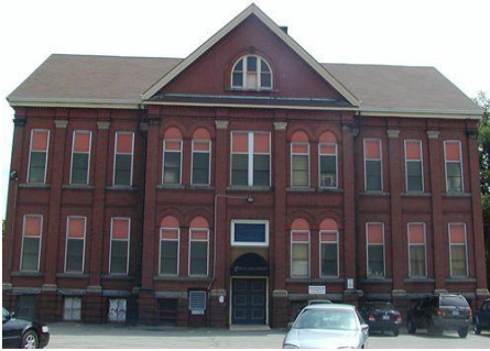
The original Halifax Schools Music Department